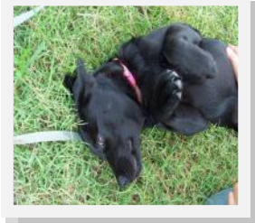
Missy loves belly rubs!

There is a new gal at Clarke Farm with an important job. The is a young black lab mix, Missy, was rescued from Suffolk Animal Control. Her principle job is to run off those troublesome Canadian geese! Missy made a half-hearted attempt last week! She is a fast learner.